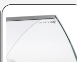
Cap in curved tempered glass