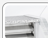
Granite top WHITE Color