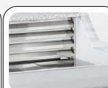
Display area in s/s AISI 316